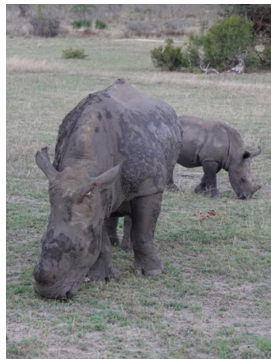
This is the white rhino

When I first heard about the horns being cut off I at once thought that that will protect them and yes, it is the right thing to do, to protect them from their biggest threat, the poachers. But without their horns they cannot defend themselves against predators, although most predators will not go for a rhino because of their size. There are other actions to protect rhinos, for example one night we were driving back from a game drive when we saw a van dropping off rangers to look for poachers at