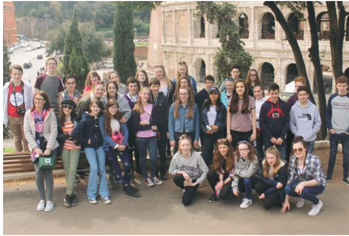
High School of Dundee pupils seized the day during an action-packed trip to the heart of Ancient Rome.

A group of 34 F2 and F3 pupils grabbed the chance to take in as many historic sights and soak up as much culture as they possibly could during a week-long Classics expedition to Rome and Sorrento in the Easter holidays.