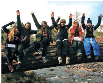
The summer marked the end of another busy year for pupils involved in the Duke of Edinburgh's Award.

In all, five Gold groups, six Silver groups and thirteen Bronze groups took part in a range of activities for the Award, culminating in practice, and then final, expeditions in locations including the Cairngorms and Great Glen, Loch Laggan, Braemar and Loch Tay.