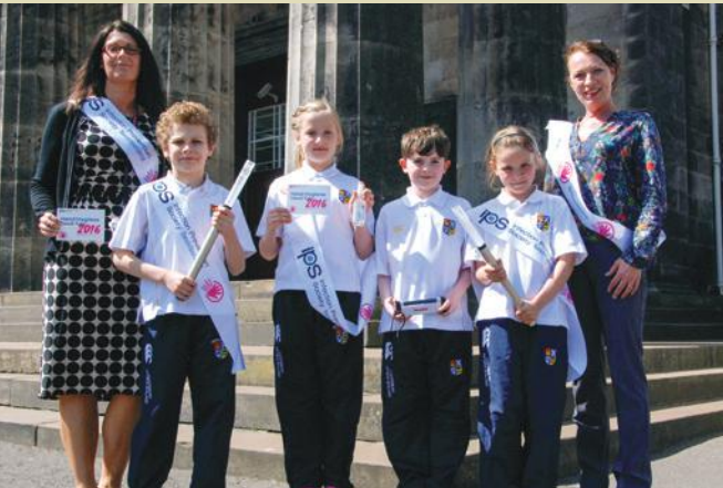
The month of May saw children in the Junior Years backing a campaign which aimed to get people spreading a message, rather than bugs.

Pupils in L4 took part in the Infection Prevention Society’s (IPS) Hand Hygiene Torch Tour 2016, an event in which