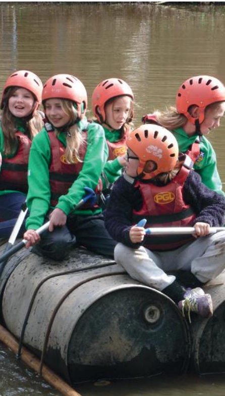
A trip into the great outdoors enabled a group of Junior Years pupils to develop more than just their sense of adventure.

During a weekend-long stay at Dalguise in Perthshire in April, children in L6 had the chance to hone their teamworking skills as they took part in a series of exciting activities like zip-wire, raft building, canoeing, mountain biking, a sensory trail, abseiling and a vertigo-inducing vertical challenge!