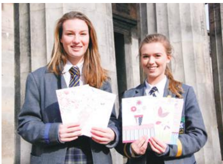
A group of F6 pupils demonstrated impressive inventiveness to raise over £1000 for Children 1st.

The eight-strong team ‘EvoLve’ came together to take on the charity’s Dragons’ Glen challenge, an annual competition