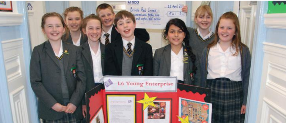
A team of L6 pupils were able to make bumper donations to two charities, thanks to a rather impressive entrepreneurial feat.

After being tasked with starting a business with just £5 each, the eight members of the L6 Young Enterprise team were able to turn their combined £40 into an amazing total of £1083.72 – an incredible 2,607% return on investment!