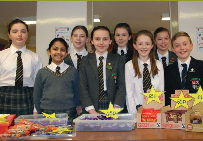
In March, a group of Junior Years pupils did a roaring trade on behalf of Fairtrade!

As part of Fairtrade Fortnight, and to raise awareness of the movement and what it stands for, pupils in the L7 Enterprise Group held a tuck shop every day before school and during morning break.