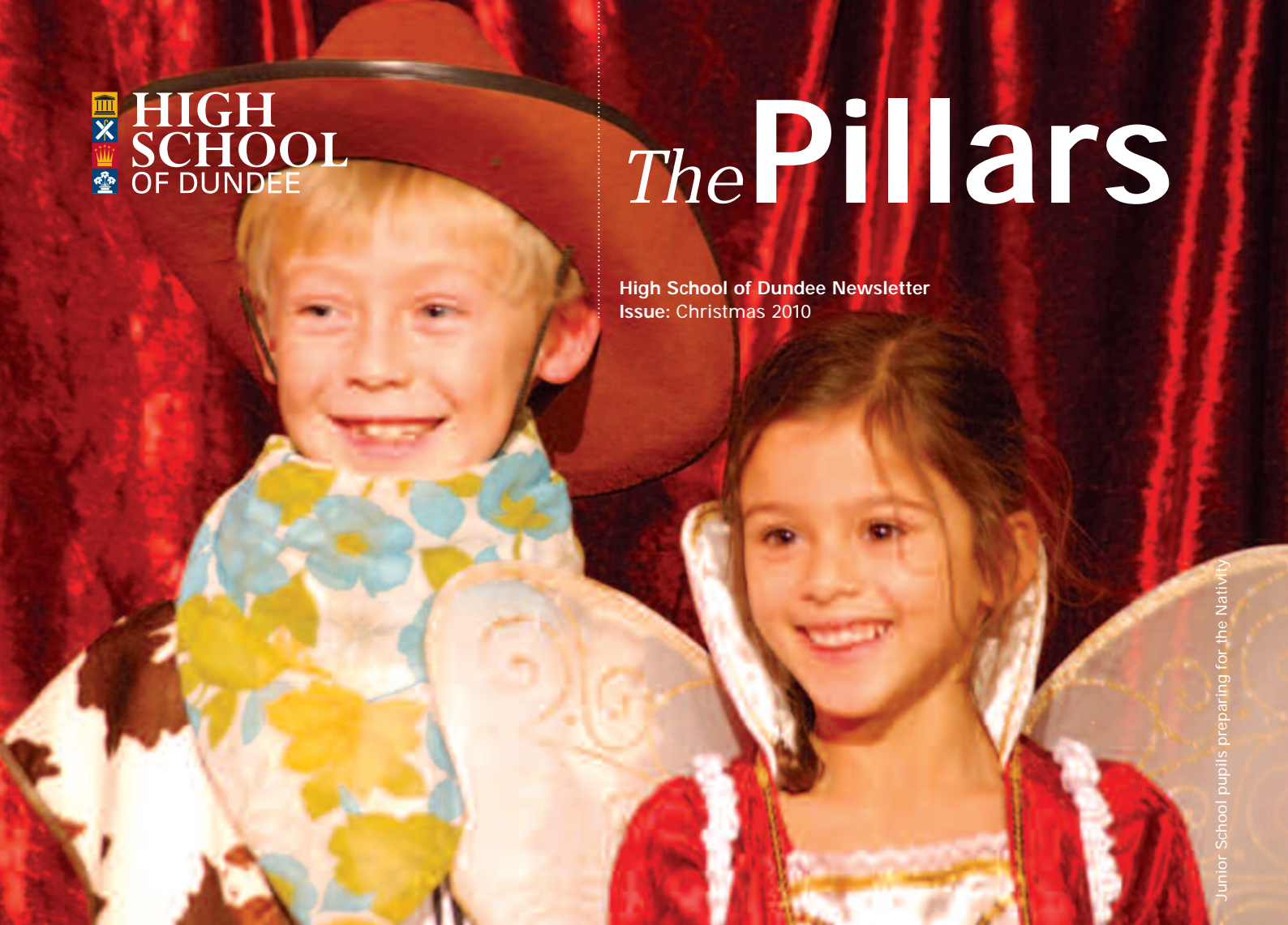
Junior School pupils preparing for the Nativity