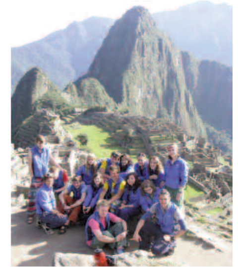
Participants in the Peru trip

Exploration continued during the October break, with a group of 40 pupils departing for a drama trip to Italy to study the history and performance techniques of commedia dell'arte. The group also visited Verona and Venice during the trip - scene of some of theatre's most enduring plays.