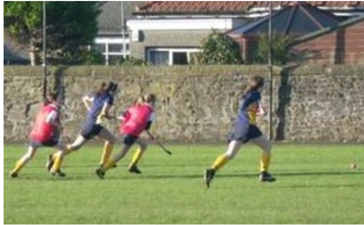
(Above) Junior school pupils in house hockey matches.

Once all the matches had been played and the points had been added up, Airlie emerged victorious in both